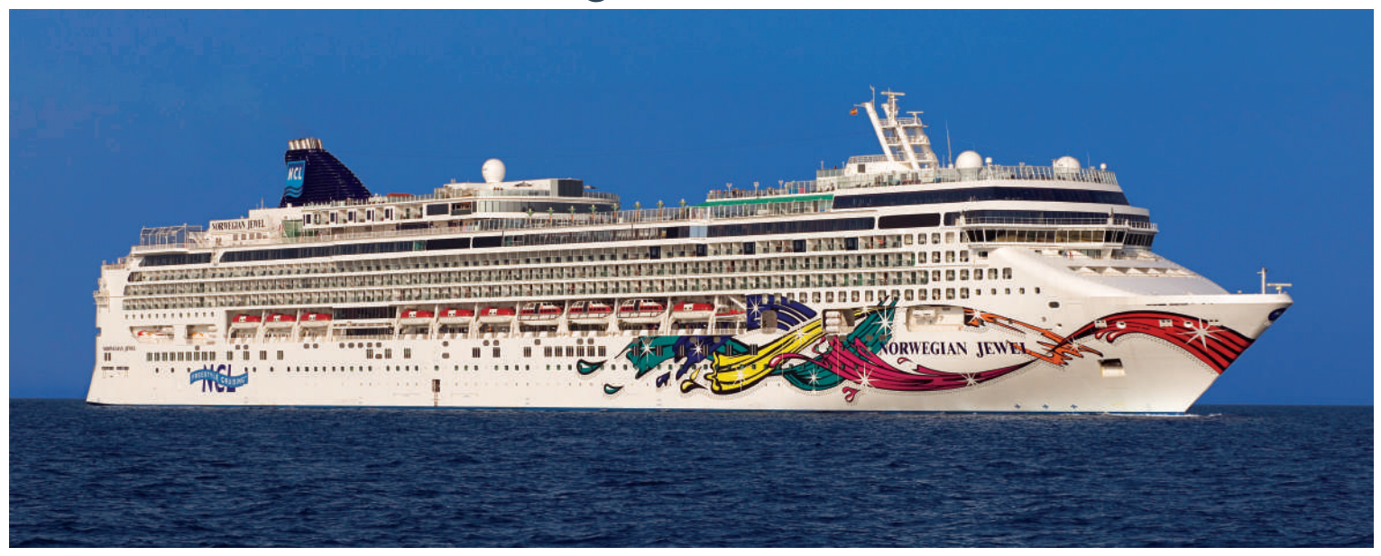
Refurbished: 2022 • Built: 2005 • Gross Tonnage: 93,502 • Guests (Double Occupancy): 2,376 • Overall Length: 965 feet • Max Beam: 125 feet • Crew: 1,069